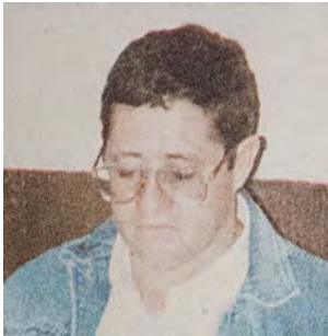
Luis Corzo Untitled (Pasaco, 1996 / No.40) 2019 Inkjet print 4 x 6 inches