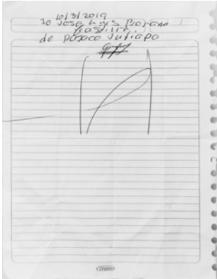
Luis Corzo Untitled (Pasaco, 1996 / No.42) 2019 Ink on paper 8 1/2 x 11 inches