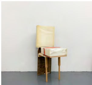
Azikiwe Mohammed Leroy's Study #2 2021 Wood, foam and transparent vinyl sheeting 16 1/2 x 43 x 23 inches