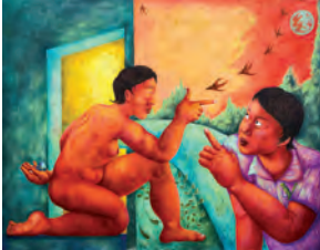
Lily Wong Fire Moon 2021 Acrylic on paper 47 x 60 inches