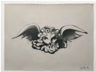
Asif Hoque 11th Floor High II 2021 Graphite on paper 22 x 30 inches