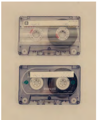
Luis Corzo Untitled (Pasaco, 1996 / No.26) 2019 Inkjet print 32 x 40 inches Edition of 3 + 2 AP