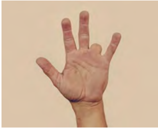
Luis Corzo Untitled (Pasaco, 1996 / No.20) 2019 Inkjet print 16 x 20 inches Edition of 3 + 2 AP