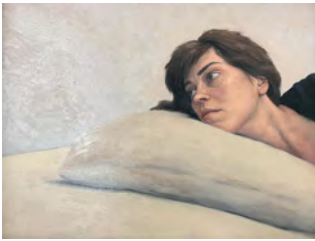
Ivana Štulić Slowdown 2021 Oil on canvas 18 x 24 inches