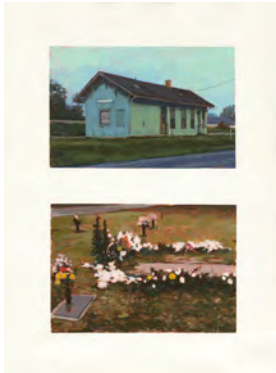
Pat Perry Craigslist Diptych 1 2021 Acrylic on paper 17 x 13 inches