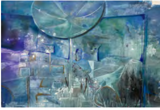
Sydney Vernon Taking up space 2021 Colored pencil, ink, and pastel on paper 36 x 52 inches