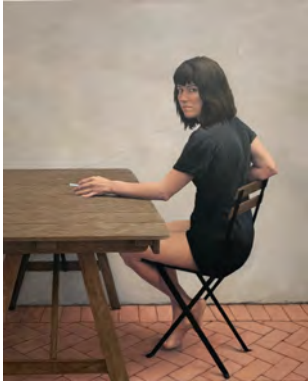
Ivana Štulić A Break 2021 Oil on canvas 60 x 48 inches