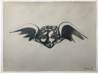
Asif Hoque 11th Floor High I 2021 Graphite on paper 22 x 30 inches