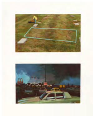
Pat Perry Craigslit Diptych 2 2021 Acrylic on paper 21 x 17 inches