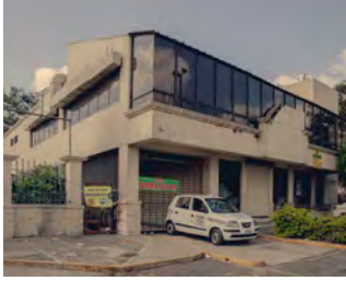
Luis Corzo Untitled (Pasaco, 1996 / No.19) 2019 Inkjet print 16 x 20 inches Edition of 3 + 2 AP