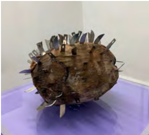
Bony Ramirez Self Portrait as Coconut 2021 Dry coconut and scalpel blades in acrylic casing Case: 12 x 12 x 12 inches Base: 13 x 13 inches