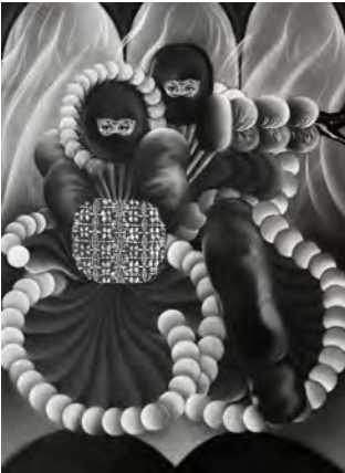
Velvet Other World Princes in the Courtyard 2021 Charcoal on paper 40 x 30 inches