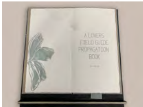
Lujan Perez Lovers Field Guide Propagation Book 2021 Hand printed hand bound book that sits on a handmade sculpture book stand comprised of handmade oil and water based inks, plexi glass, birch plywood, fishing wire, screws, magic sculpt, xerox transfers, trace monotype on arches paper 21 x 21 x 48 inches