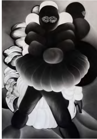
Velvet Other World © Royal Court In the Love Light , 2021.

Opening Reception: Friday, September 10, 5–7 pm